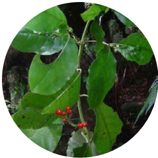
Kanono Coprosma grandifolia