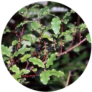
Mapou/ Red matipo Myrsine australis