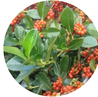
Karamu Coprosma robusta