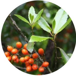
Porokaiwhiri, Pigeonwood Hedycarya arborea