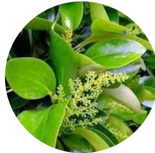
Puka Griselinia lucida