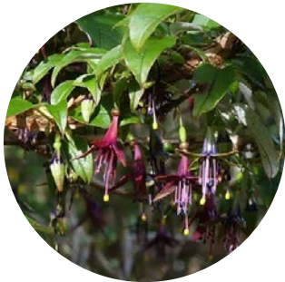
Kōtukutuku, Tree fuchsia Fuchsia excorticata