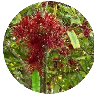
Rewarewa, NZ honeysuckle Knightia excelsa