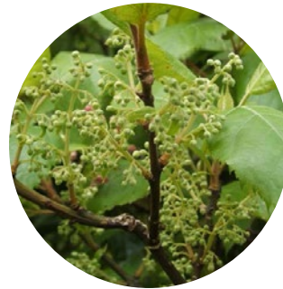
Makomako, Wineberry Aristotelia serrata