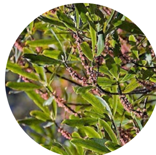
Toro Myrsine salicina