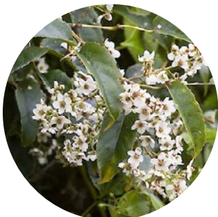
Tātarāmoa, Bush lawyer Rubus cissoides